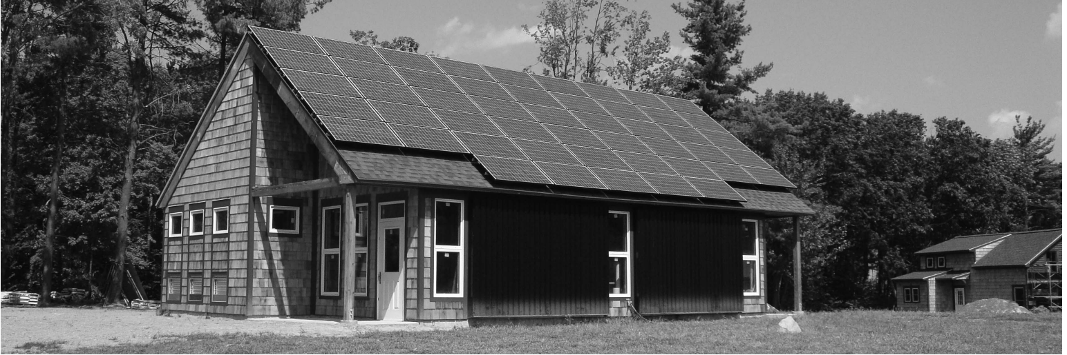
At Noble View Outdoor Center, the bathhouse's exterior is completed. It's expected to be open this November.

The AMC 2010 Fall Gathering, hosted by the Worcester Chapter, will be held October 15–17 at the Prindle Pond Conference Center Hilltop, Charlton, MA. Whether you enjoy hiking, biking, paddling, rock climbing, or just like to socialize with other AMC members (or non-members), October is a great time to explore central Massachusetts. Also, family-oriented activities will be offered, so bring your children and grandchildren. Top it all off with lively Saturday evening entertainment and a bonfire. This will be an event you won't want to miss! For more information, check out our website at: http://www.amcworchester.org/FallGathering2010.htm .