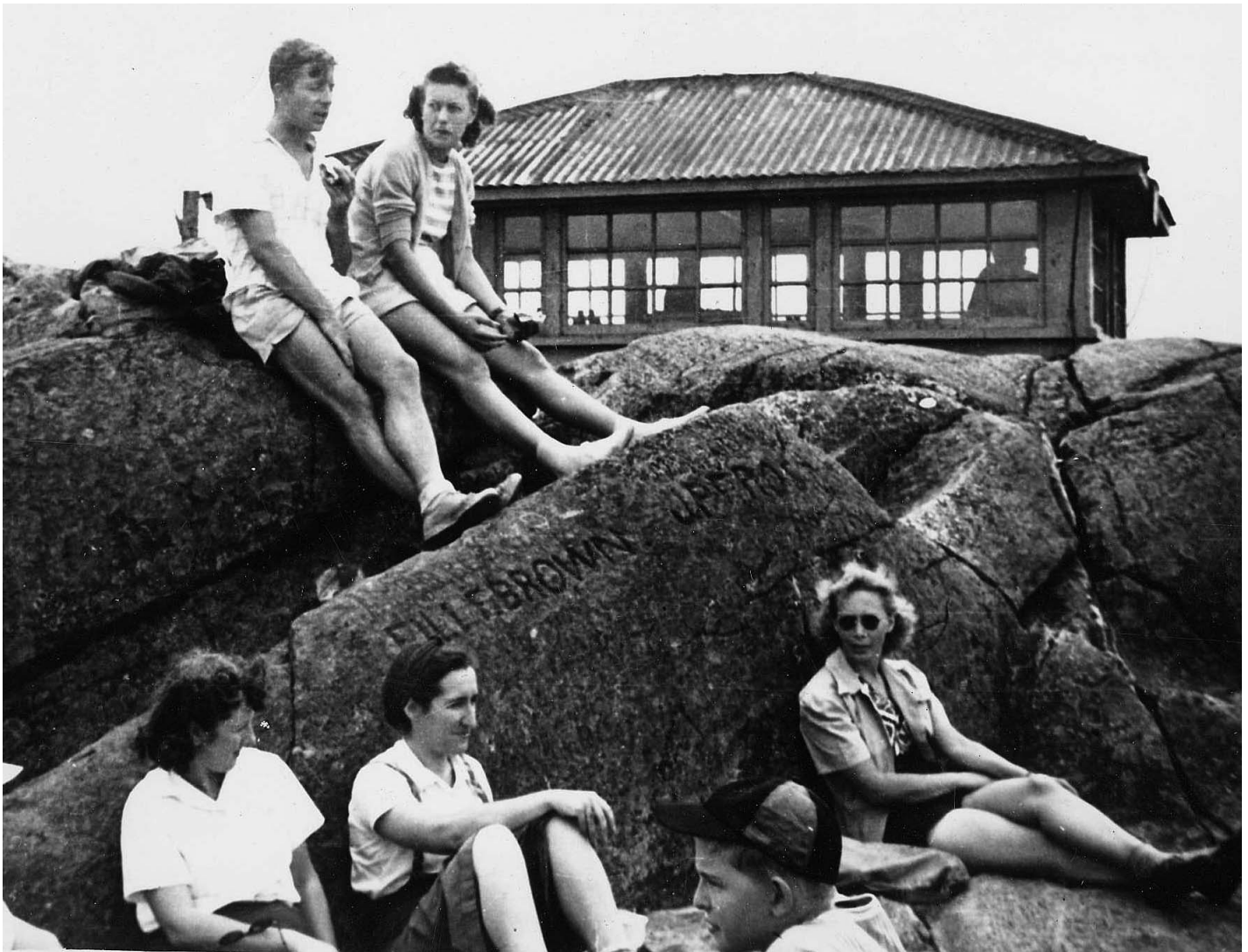
Berkshire Chapter members on the summit of Mt. Monadnock, 1940.