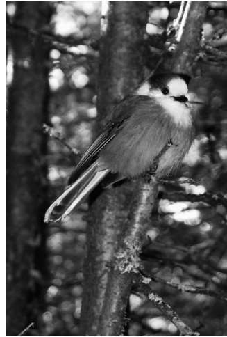
Gray Jay

In the 113th CBC, as we started our route Al grumbled about not skiing for the second year in a row in 2012. He informed me the day was a miserable one when we were ascending the Crawford Path. But then we found the grosbeaks, and later a family of three Gray Jays descended on us just after we found Boreal Chickadees. Different Gray Jays met us at Mizpah, and descending the slopes of Jackson a single one also shared the trail with us for a few minutes. By the time we were back at the road just before dark, Al was telling me that we needed to remember the time it took us from the hut to the road, “for next year.”