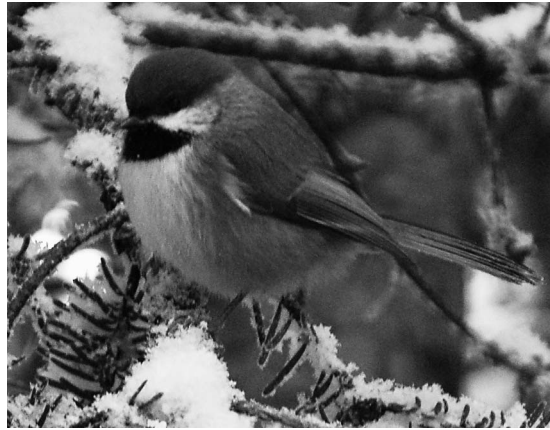
Boreal Chickadee

I have also been able to take a few nice pictures, such as the Boreal Chickadee and Gray Jay. Unfortunately, we could not get pictures of some exciting finds, such as the White-winged Crossbill who was singing his