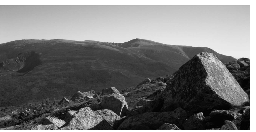
View of Katahdin from North Brother.

to his car and as he did he told me about his winter series. As these classes are widely popular and fill up early, I never seemed to remember to sign up. I signed up, late again, in 2011, got on the waiting list and fortunately slipped into one of the last spots. This training was great and the company of fellow hikers was even better. Since we were doing a weekly hike on Saturdays, and the Maine mountains were fairly nearby (2.5 hours to Sugarloaf), I decided to trek over one day (Nov. 20) after the Saturday hike and do some peaks the following day.