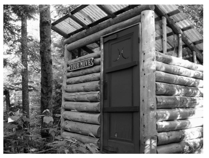
Outhouse near Piazza Rock.

decision. The cold wind howled relentlessly all night long and I woke that morning to continued flurries and decided to again pack it in. I headed down from the Notch into Bethel for some breakfast. After breakfast and the skies opening up to pure blue, I decided to head back to the notch and give it a try. I loaded up on emergency winter supplies including an extra pair of wool socks to act as layered gloves (as I had not thought to bring my arctic mittens) and headed up the Eyebrow side of the loop trail about