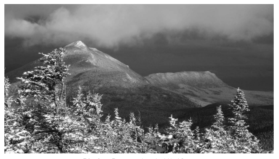
Bigelow Range.

On day two, we hit the AT and took the approximately 6-mile hike to Saddleback, passing the impressive Piazza Rock, a large slab that over-