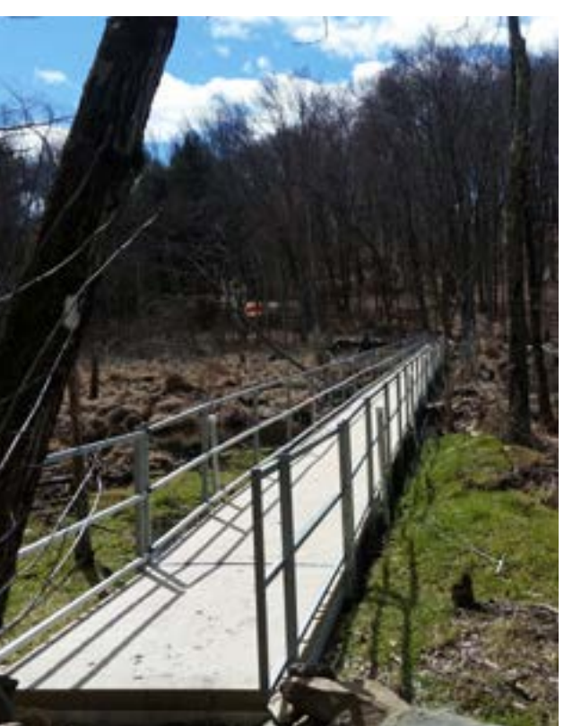
A northern view of the NET section 1 bridge.